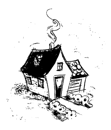
The second step is aimed at fostering neighborhoods of local artists. The City of

Moreno Valley has one of the highest rates of foreclosures and abandoned properties in the country. The City's Community and Economic Development Department through its Neighborhood Preservation Division Affordable Home Program could set aside a block of foreclosed/abandoned homes specifically for the sale to established artists.